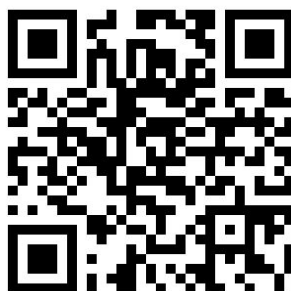
Manual(Word) Download QR Code