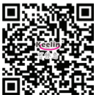
Wechat Official Account