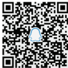
QQ Group of Keelin Users